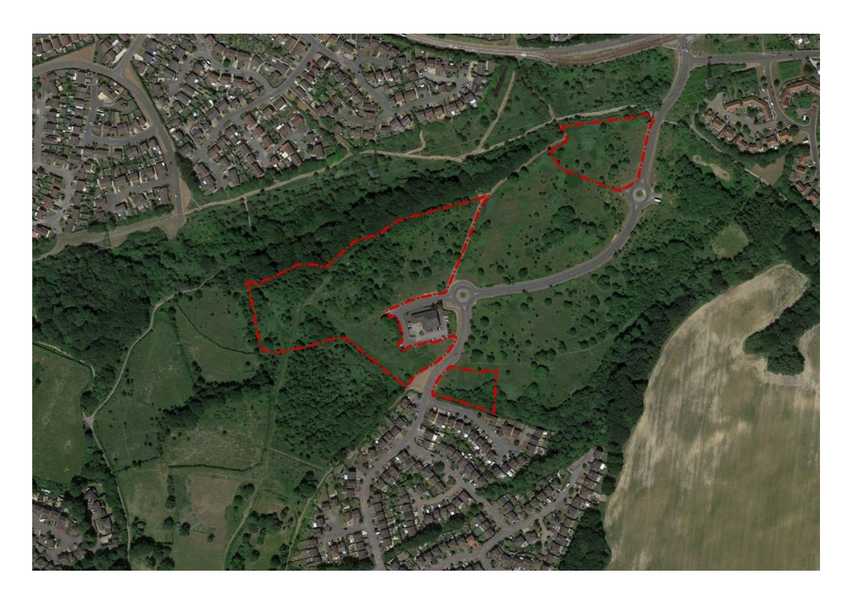
Figure 7: Aerial Image dated 2018