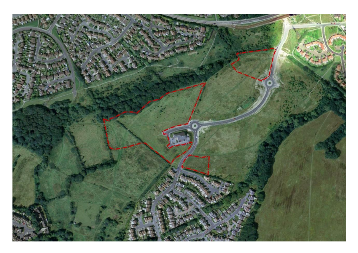
Figure 5: Aerial image showing earliest tree establishment on the site dated 2007 (Google Earth 2020)

2.2.24 Figure 5 shows the Site in 2007 showing the constructed medical centre and access road. This image shows the start of the establishment of vegetation within the Site and wider landscape.